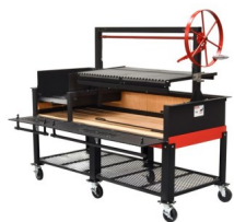
(shown with Brasero Coal Starter)