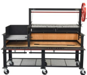
(shown with Brasero Coal Starter)