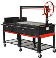
(shown with Brasero Coal Starter)